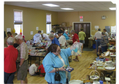
Garage Sale at the church was huge success.