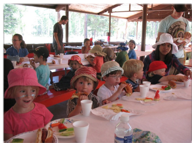
United 4 Kids day camp at Camp Stone